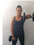
Dumbbell Front Raises